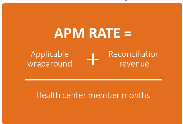
FIGURE 2. Rate Calculation for Oregon's FQHC APM