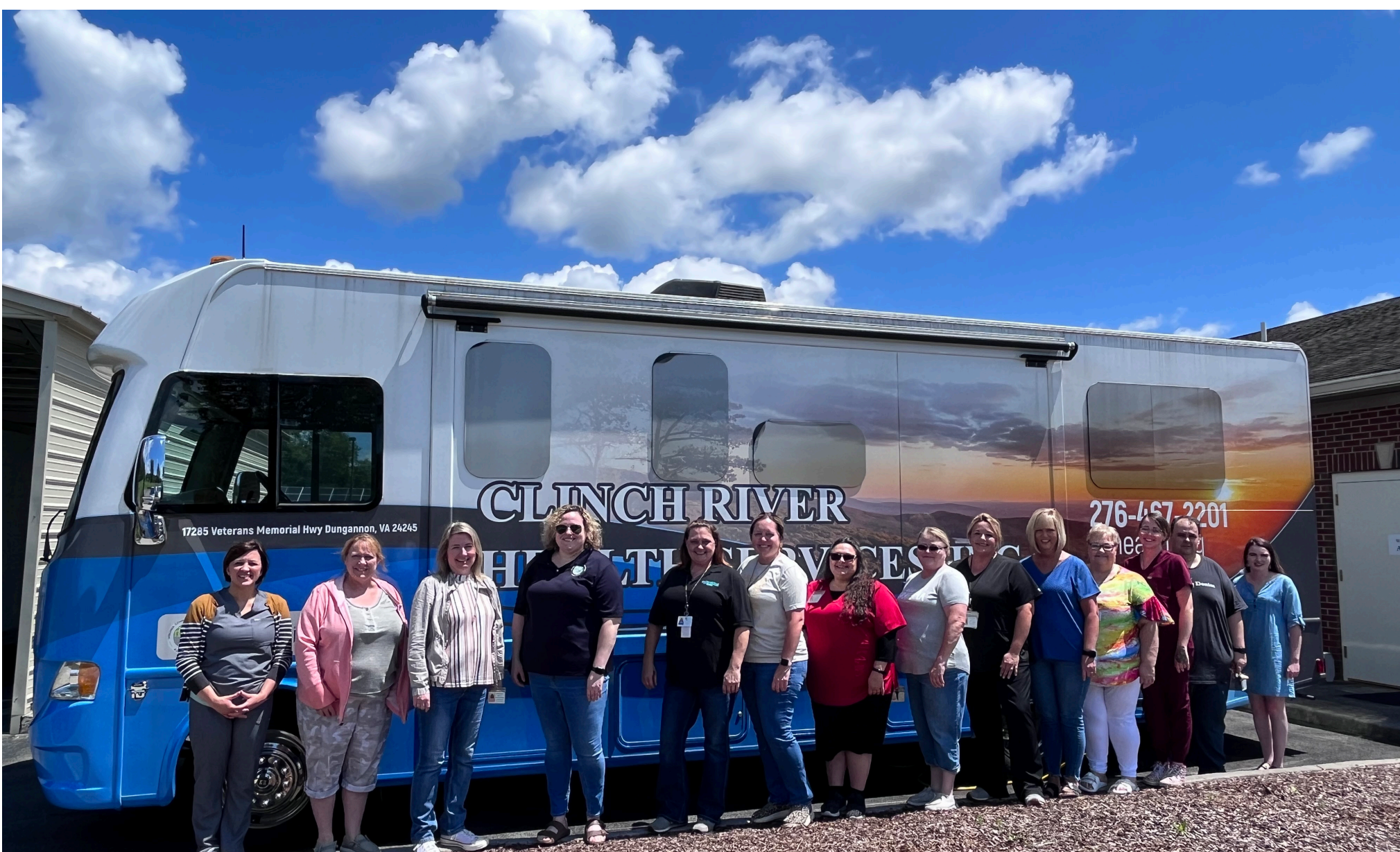
Clinch River Health Services in Dungannon, VA.

VCHA has seven FQHCs with Mobile Healthcare Programs across the Commonwealth of Virginia.