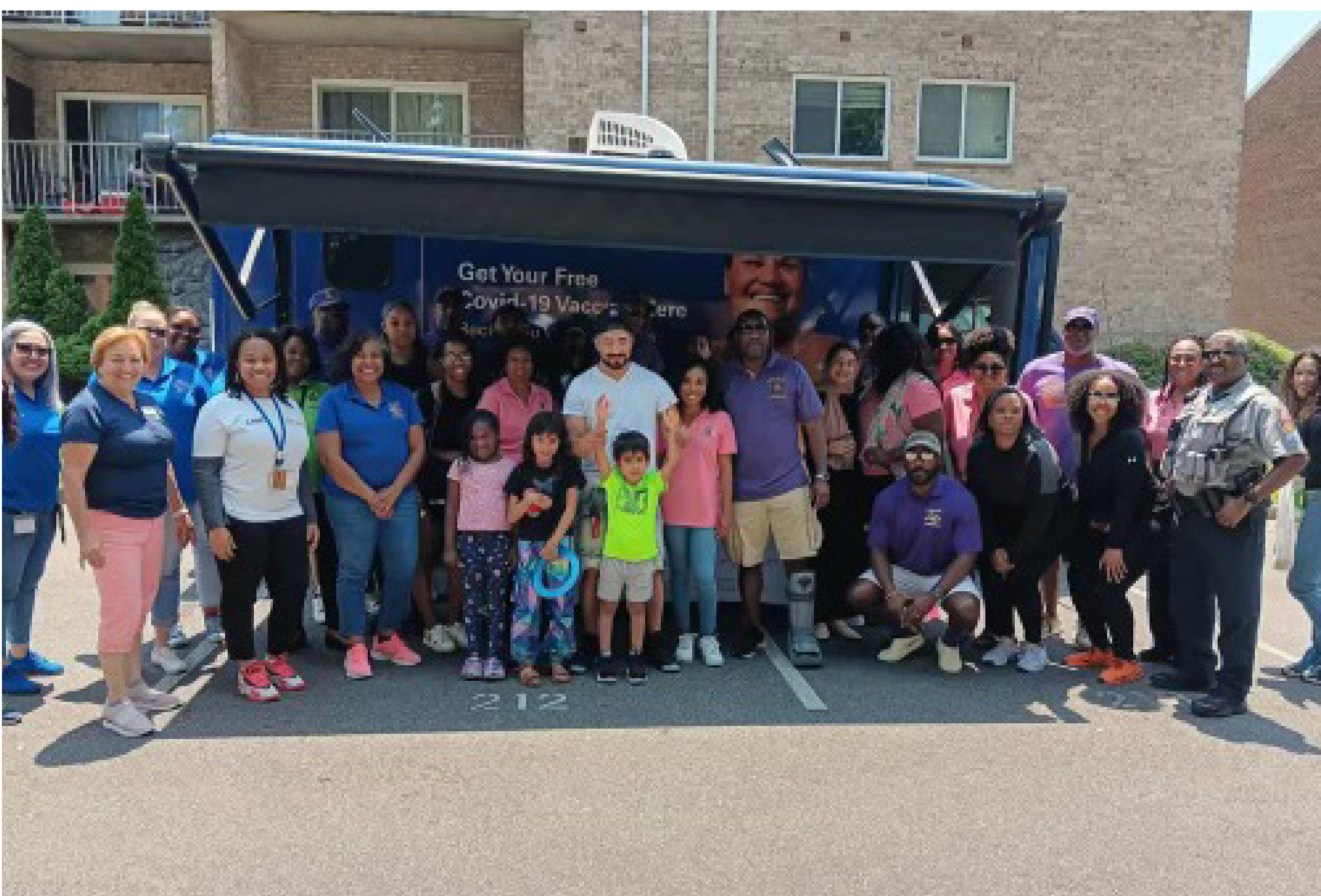
Neighborhood Health in Alexandria, VA