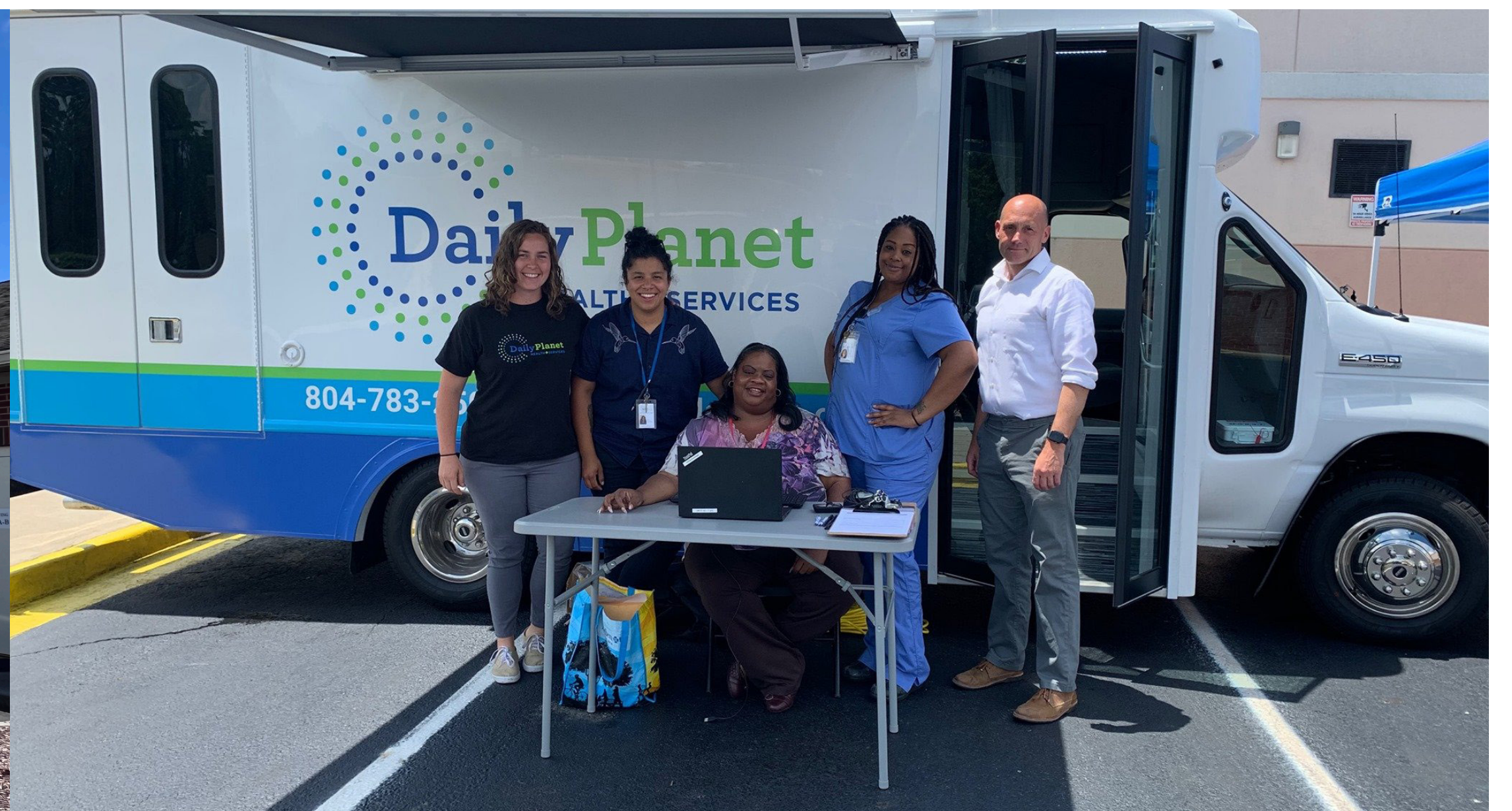
Daily Planet Health Services in Richmond, VA.