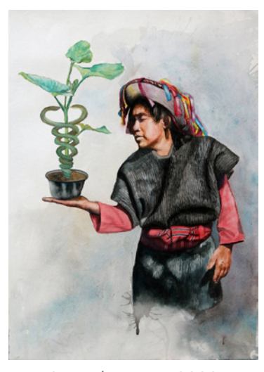
Sacred pepper, 2020, watercolor on cotton paper

Come join us for the artwork unveiling and presentation of scholarships during the Migrant Health Awards and Networking Luncheon.