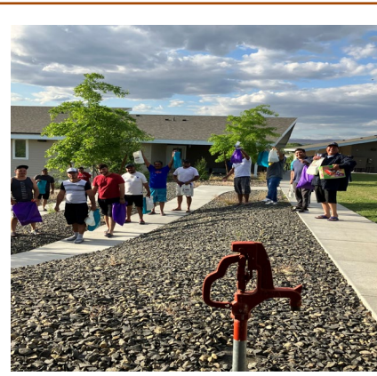
Members of "Neighborhood Connections" preparing for outdoor wellness hour.