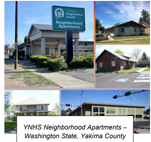
YNHS Neighborhood Apartments – Washington State, Yakima County

The health center also prioritizes community engagement as a pillar of its stewardship. This is evident in one of the health center's flagship programs , centered around supporting the health needs of individuals experiencing homelessness. The program was formed in 2004 after a Community Health Needs Assessment (CHNA) revealed a significant proportion of unhoused individuals in Yakima County. YNHS immediately began to form efforts to reduce the health effects of homelessness.